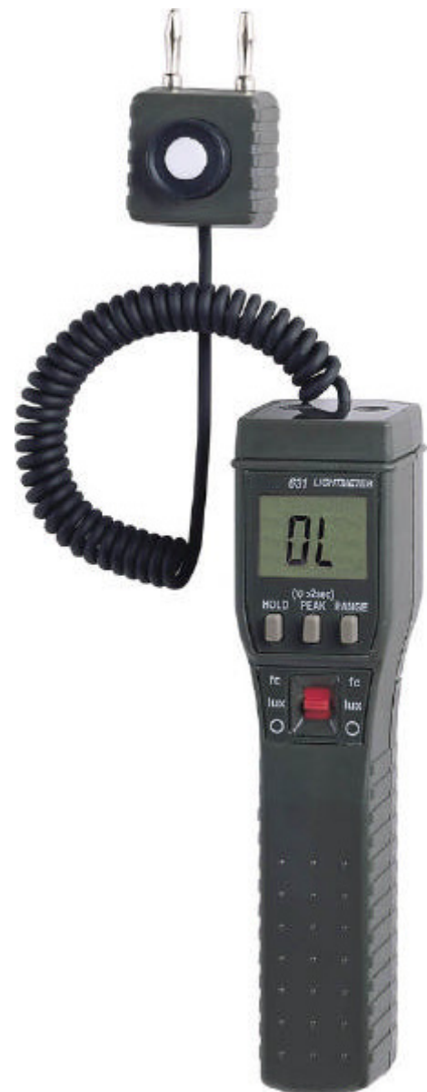
CIE Photopic Curve