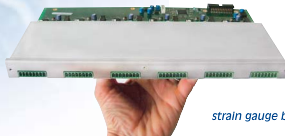
strain gauge board