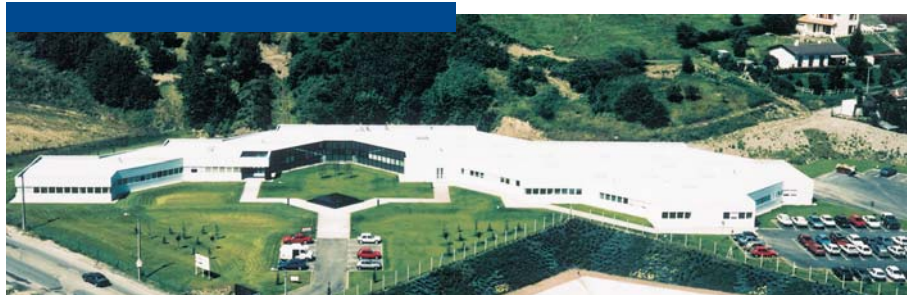
Design and manufacturing center in Saint-Etienne / France