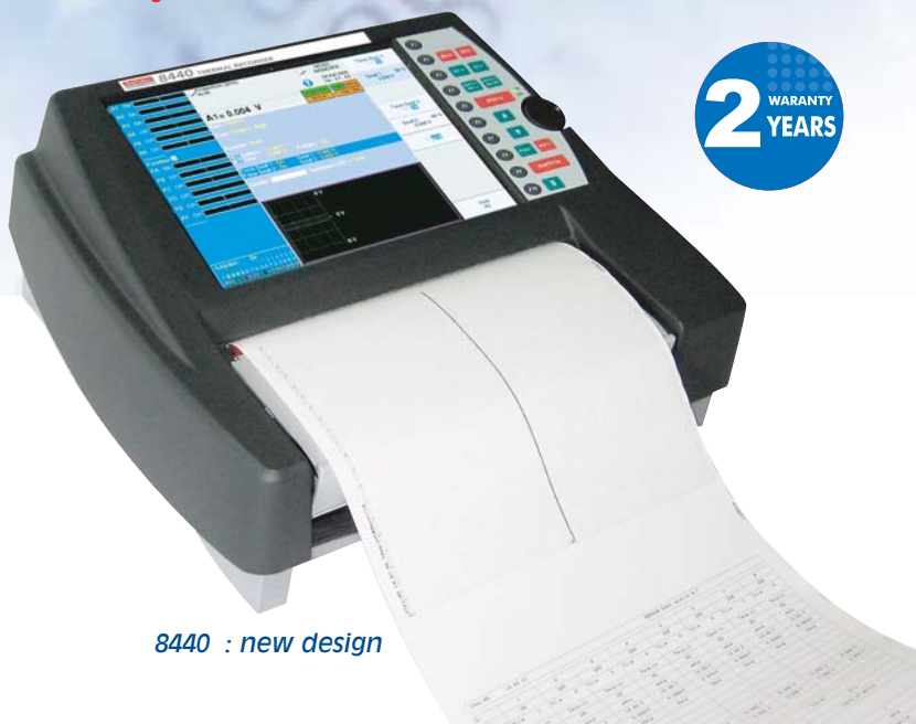
8440 : new design