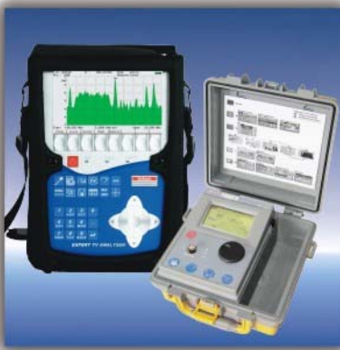
TV Field Strength Meters For satellite, terrestrial & cable