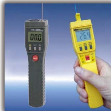
Stix® Thermometers Thermocouple & infrared types