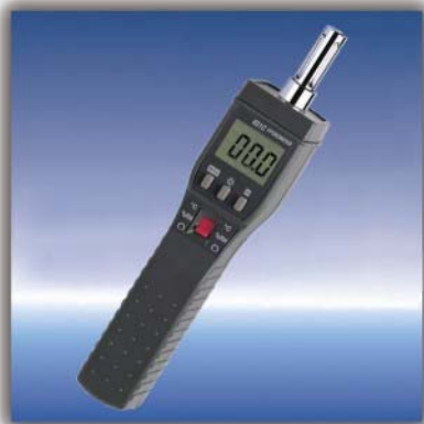
Stix® Thermo-Hygro Meters Temperature and humidity combined