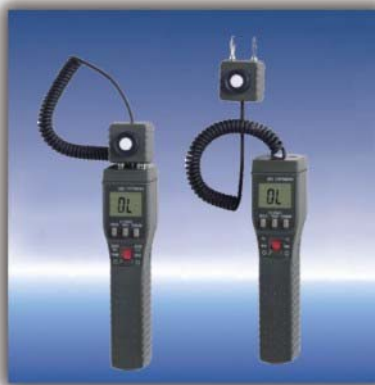
Stix® Light Meters Compact digital lux meters