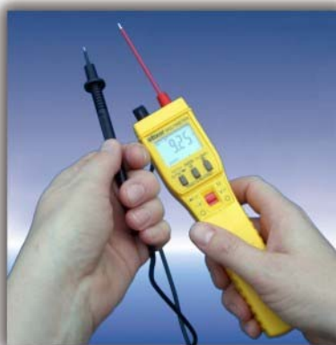
Stix® Multimeters Rugged tool bag size electrical testers