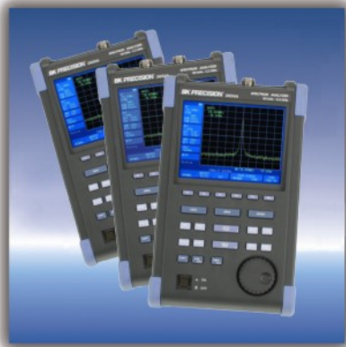
Portable Spectrum Analysers 2.0GHz, 3.3GHz and 8.5GHz models