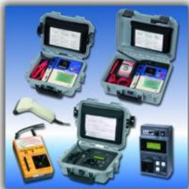
Appliance Safety Testers VDE 0701/0702/0751 standards