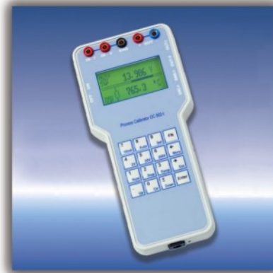
Process Calibrators Simulate/check thermocouples & loops