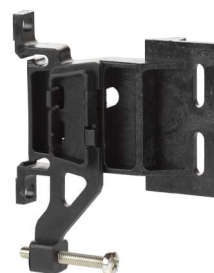
SRH-99 brackets for mounting devices on DIN 35/7.5 or 15 rail (2 pcs.)