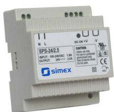
SPS-24/2,5 60W single output industrial DIN rail power supply